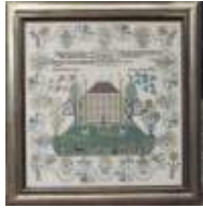
The Richmond Sampler