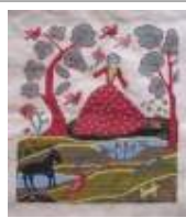
The Garden Glade