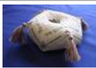
Busy Bee Pin Pillow