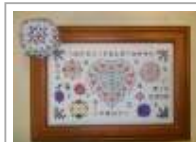
Oak Box Sampler