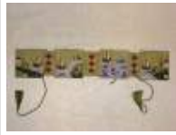
A Canadian Journey 2 of 2