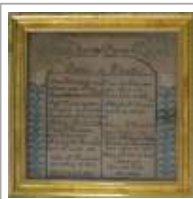
Batcheller Family Record