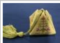
Honor Thy Needle 1 of 2