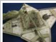
Honor Thy Needle 1 of 2