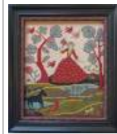
The Garden Glade