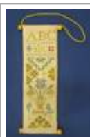
Quaker Bell Pull