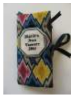
Quaker Sewing Case 1 of 2