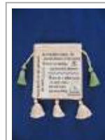
Carnation Sweet Bag 1 of 2