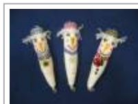
Snow Drop Ornaments