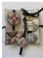
Quaker Sewing Case 2 of 2