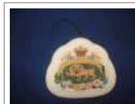
Lion Christmas Ornament