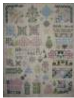
A Swiss Sampler