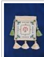
Carnation Sweet Bag 2 of 2