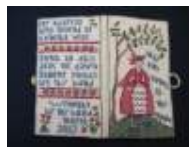
Off to Williamsburg 3 of 3