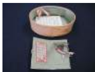
Off to Williamsburg 1 of 3