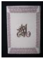
Embroiderer's Notebook 2 of 3