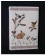
Embroiderer's Notebook 1 of 3