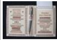
Embroiderer's Notebook 3 of 3