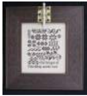
May the Hinge of Friendship