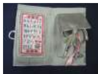
Off to Williamsburg 2 of 3