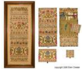
A Needleworkers Sampler Huswif

Project Description: This lovely project can be finished as a framed sampler or as a huswif with a matching needlebook. A “huswif” or “hussif” is the name for a case which stores needlework supplies. Before the days of pockets on clothing, women often carried a huswif in one of the large tie-on pockets worn under their skirts. The use of a huswif was certainly not exclusive to women. Sailors, soldiers, and other men who needed sewing items sometimes carried huswifs.