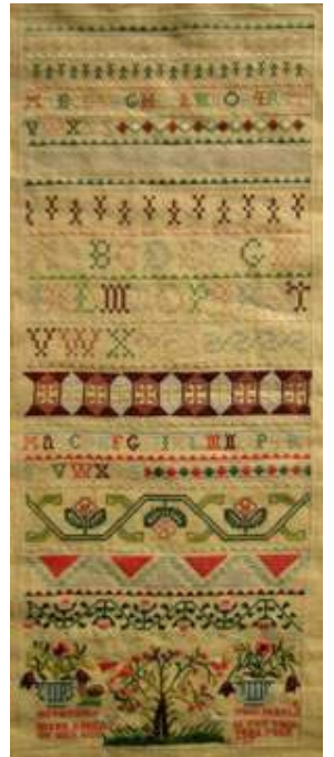
Hepzebak Baker 1737

Click on the picture for a larger image.