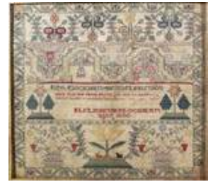
1730 Scottish Sampler

The kit will have the 40 count linen, silk floss, photograph, chart/instructions, and needle.